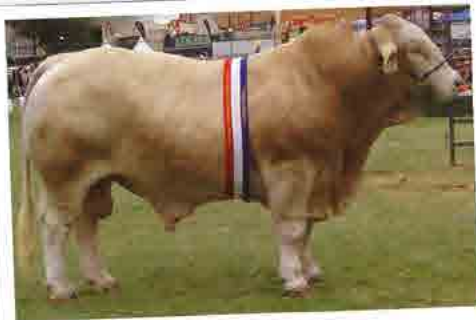
KANDANGA VALLEY JESUIT