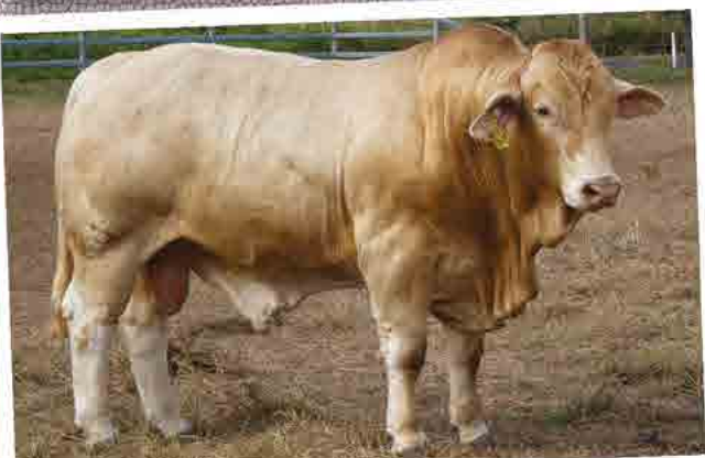
LOT 71: Kandanga Valley Tenabul