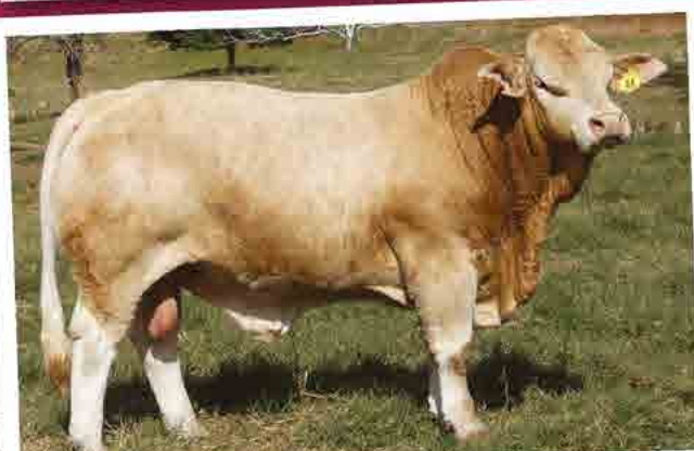
LOT 69: Kandanga Valley Tripoli