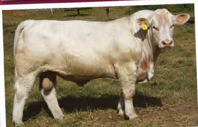
LOT 2: Kandanga Valley Utility (P)