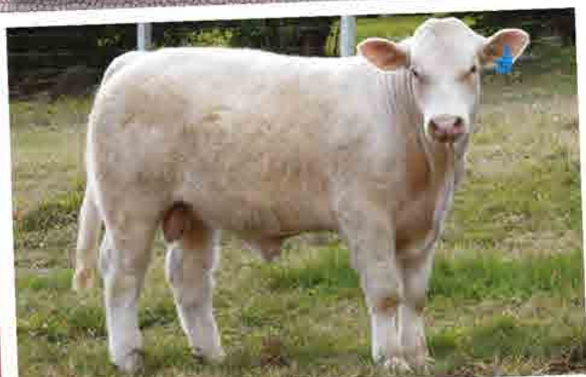
LOT 50: Kandanga Valley Unabridged U408E (P)