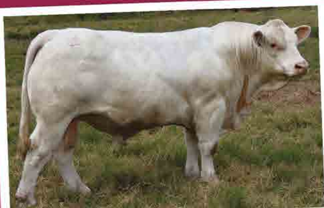
LOT 1: Kandanga Valley Tulsan