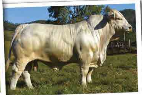
KANDANGA VALLEY MADDOX