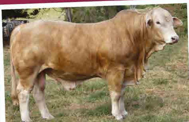
LOT 67: Kandanga Valley Tuxedo (P)