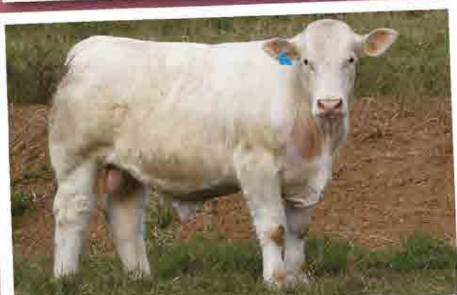
LOT 57: Kandanga Valley Uber U252E (P/S)