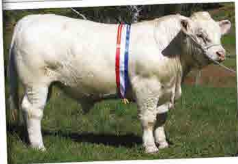
KANDANGA VALLEY YAHOO