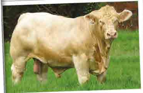
KANDANGA VALLEY CHABLIS (P)