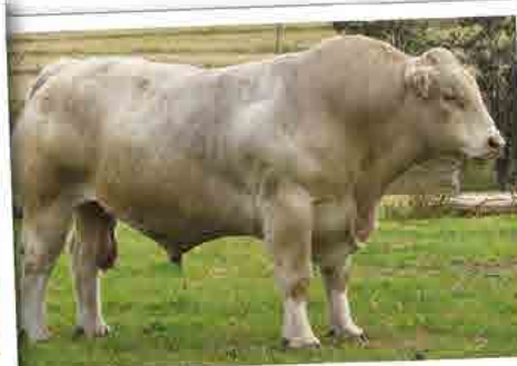
KANDANGA VALLEY ALEXANDER