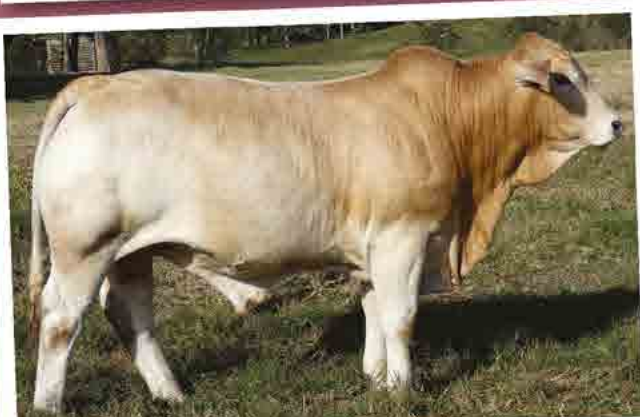
LOT 86: Kandanga Valley Uptown (P)