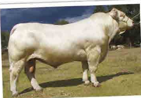
MORGIANA HOUSE WEST AVEYRON