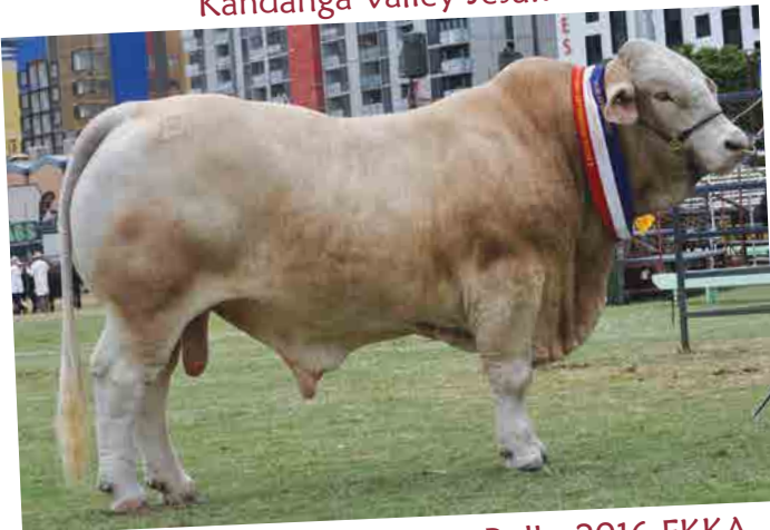
Grand Champion Charbray Bull - 2016 EKKA