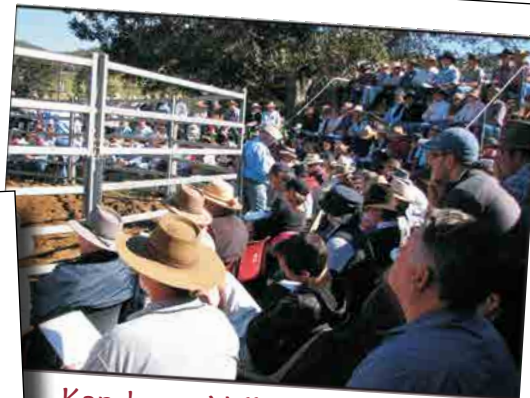
Kandanga Valley Sale Crowd