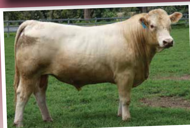
LOT 35: KANDANGA VALLEY SCOOBIE (P)