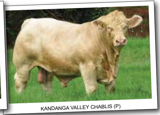
KANDANGA VALLEY CHABLIS (P)

Welcome one and all to our 4th Annual 'Summer' bull sale. This year to be held on Saturday January 20th, commencing 10am at 'Warravale' in the beautiful Mary Valley.