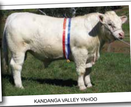
KANDANGA VALLEY YAHOO