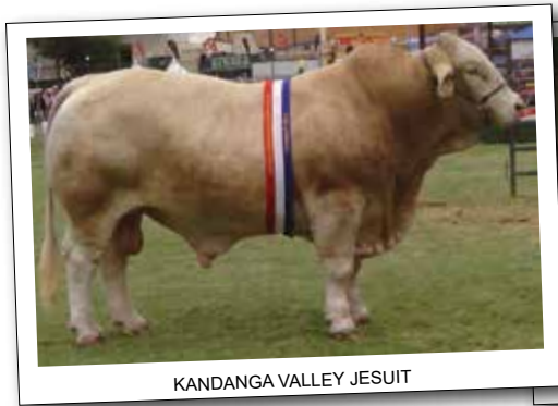
KANDANGA VALLEY JESUIT