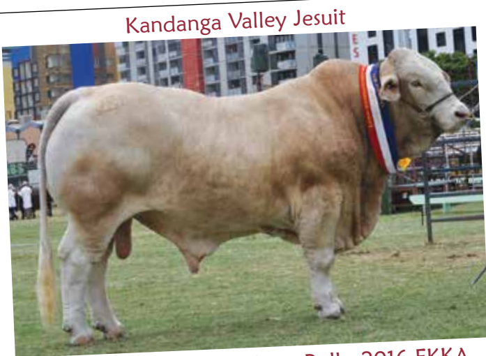
Grand Champion Charbray Bull - 2016 EKKA