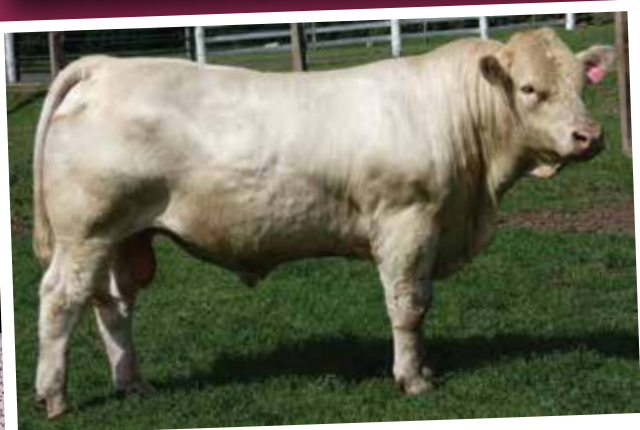
LOT 2: KANDANGA VALLEY STYNES