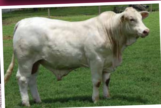
LOT 43: KANDANGA VALLEY SEDUNA