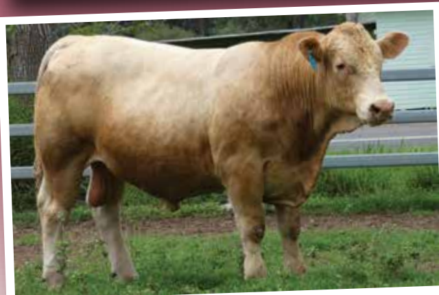
LOT 33: KANDANGA VALLEY SPRINGER (P)