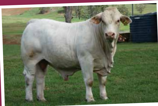
LOT 40: KANDANGA VALLEY SUTRAS