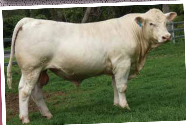
LOT 5: KANDANGA VALLEY THINKIN (P)