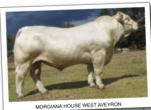
MORGIANA HOUSE WEST AVEYRON