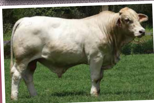
LOT 47: KANDANGA VALLEY TRIBUNE (PS)