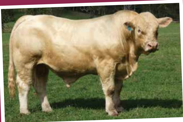
LOT 1: KANDANGA VALLEY SIR (P) (R/F)